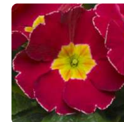
Rose Frost 70051015