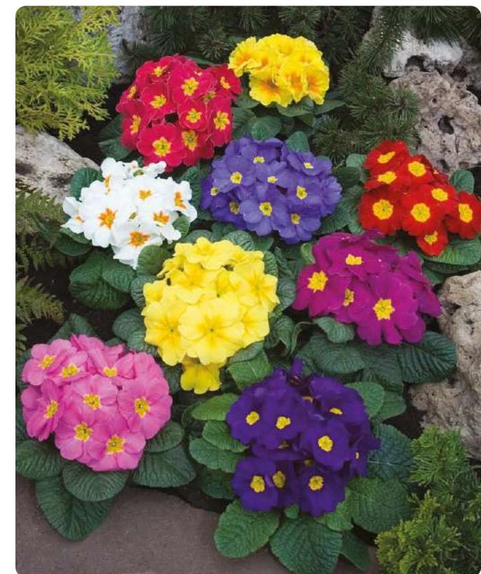
Orion Mix 70007968