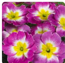
Lilac Flame 70045472