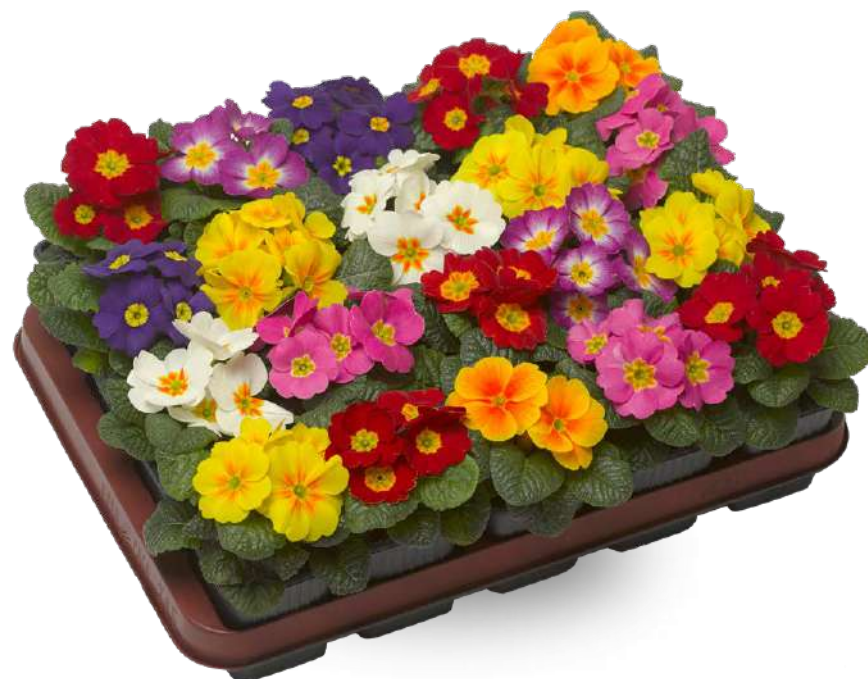
Primera Mix 70007757