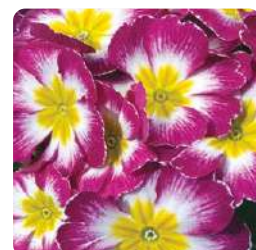
Wine Flame Shades 70007773