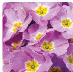
Lavender Shades 70020148