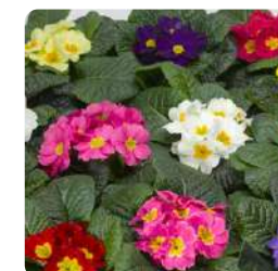
South Mix 70027277