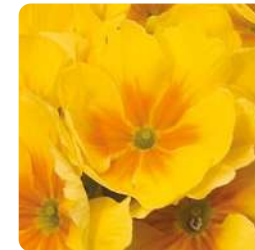
Yellow with Eye 70045491