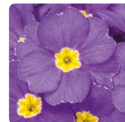
Mid Blue 70007079