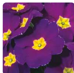
Violet Shades 70020151