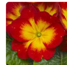
Scarlet Flame 70051016