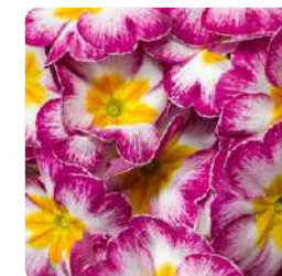
Lilac Flame 70039321