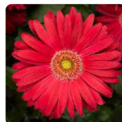
Deep Rose 70019516