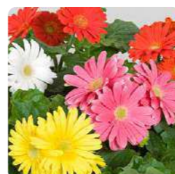
Formula Mix 70000972