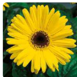
Yellow Dark Center 70000969