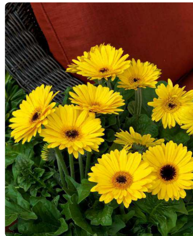
Bengal Yellow with Eye 70040767