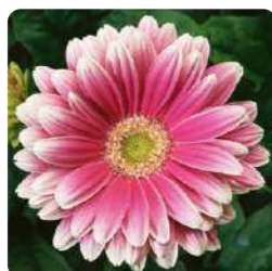
Rose Picotee 70000977