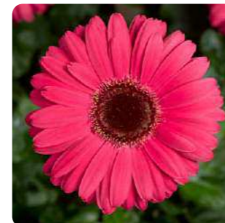
Rose with Eye 70035518