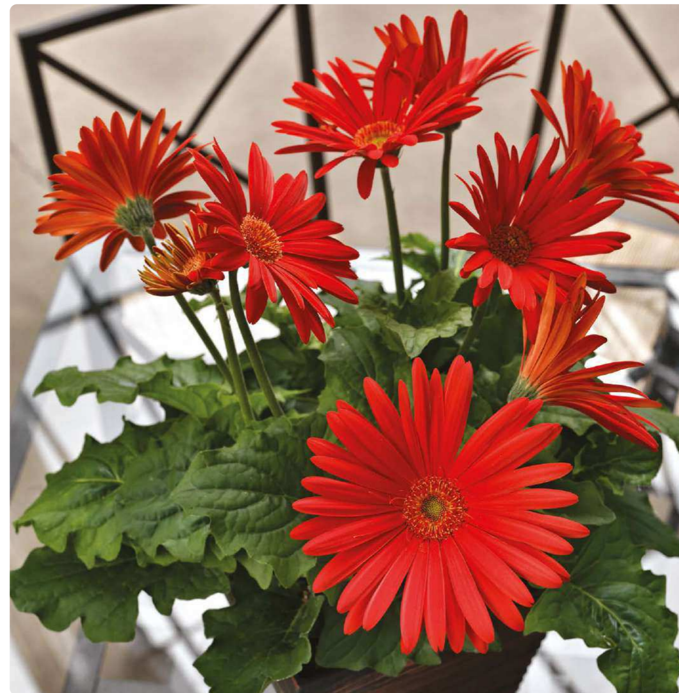
Scarlet Elephant 70019504