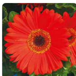
Scarlet Shades Dark Center 70000983