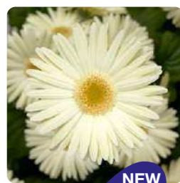
White Imp. 70066066