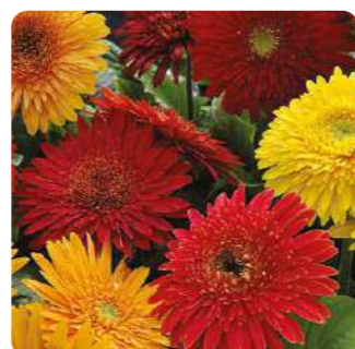
Autumn Colors 70019519