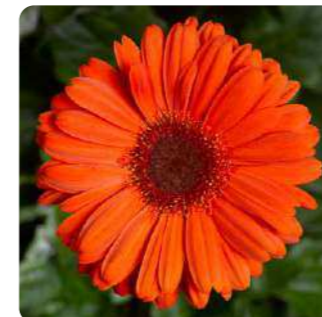
Orange with Eye 70035514