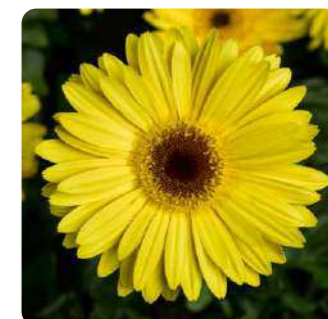
Yellow with Eye 70040767