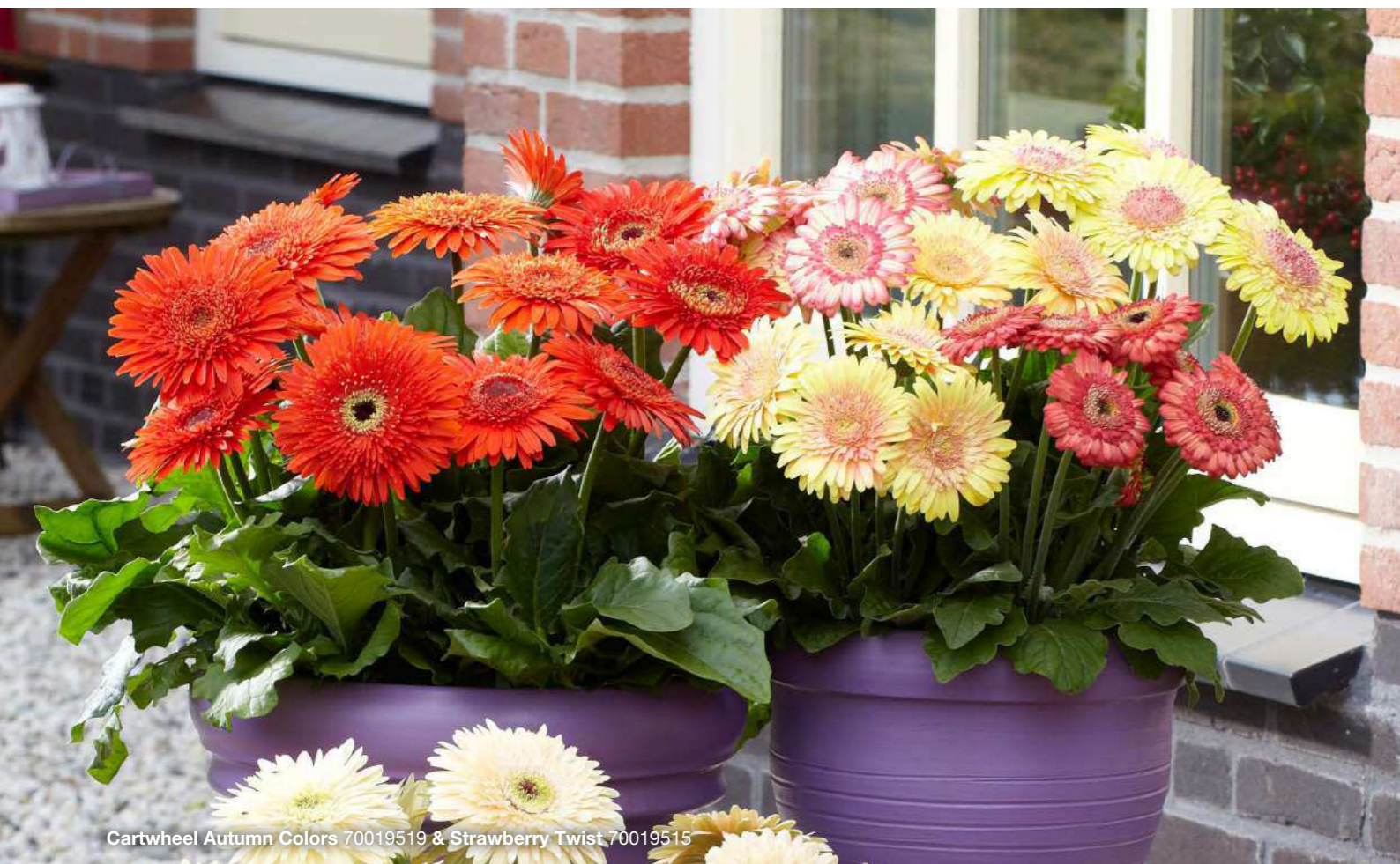
Cartwheel Autumn Colors 70019519 & Strawberry Twist 70019515