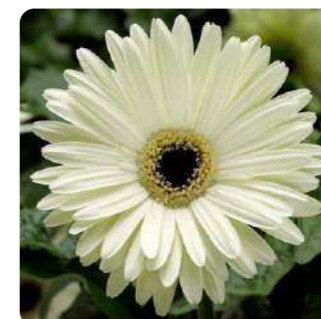
White with Eye 70035509