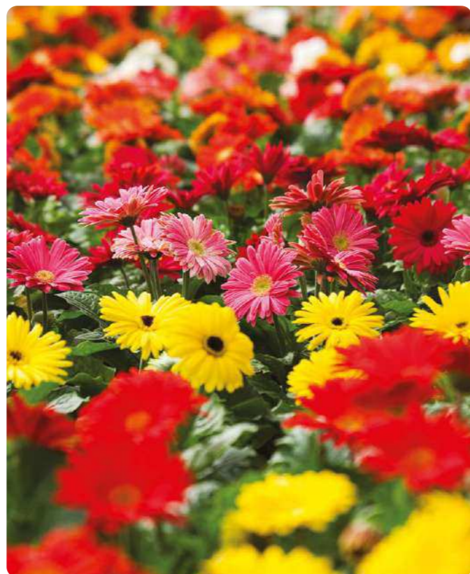
Jaguar Formula Mix 70000972