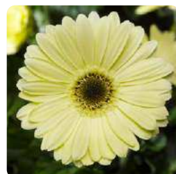
Lemon Dark Center 70019523