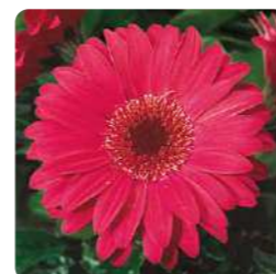
Rose Dark Center 70000970