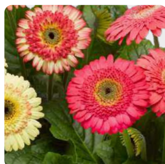
Strawberry Twist 70019515