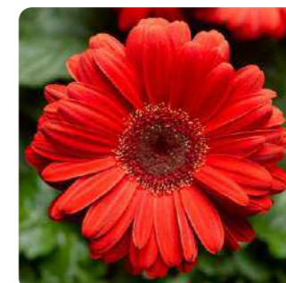
Red with Eye 70035498