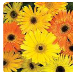
Fire Dark Center 70007957