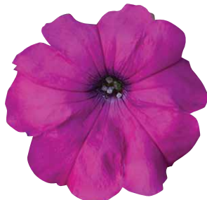
Lo Rider Violet