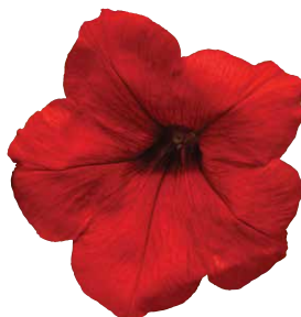
Lo Rider Red