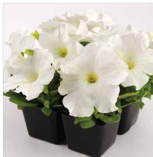
Ez Rider White