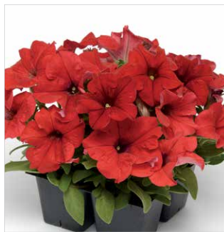
Ez Rider Red