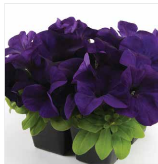
Ez Rider Blue