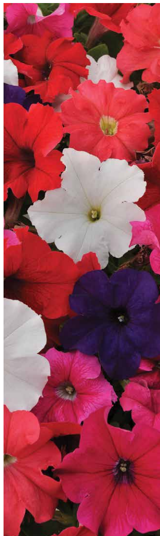
Ez Rider Mixture