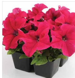
Ez Rider Rose