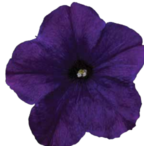
Lo Rider Blue