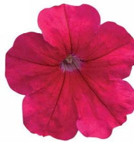
Lo Rider Rose