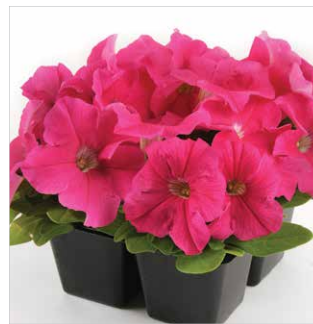
Ez Rider Deep Pink