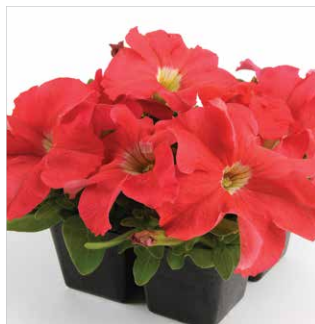
Ez Rider Deep Salmon