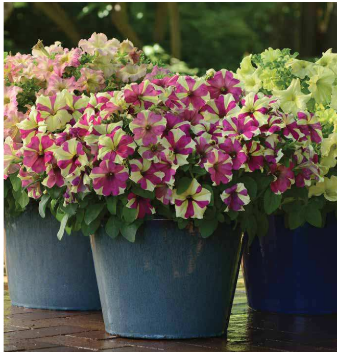
Sophistica Lime Bicolor, Antique Shades & Lime Green