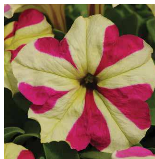
Sophistica Lime Bicolor