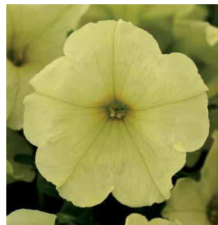
Debonair Lime Green