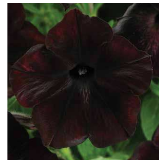
Debonair Black Cherry