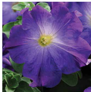
Sophistica Blue Morn