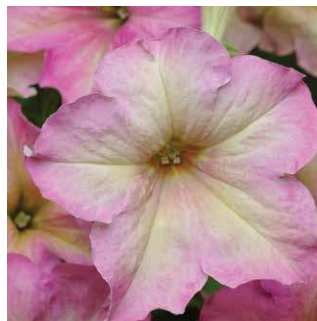
Sophistica Antique Shades