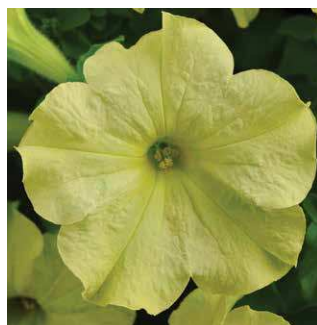
Sophistica Lime Green