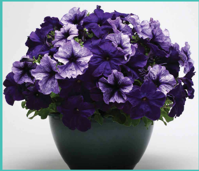
Fuseables Pleasantly Blue, see page 233.

Use Dreams and Daddy petunias to add striking hues to combos like this!