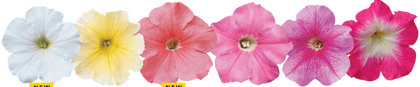
NEW White Improved