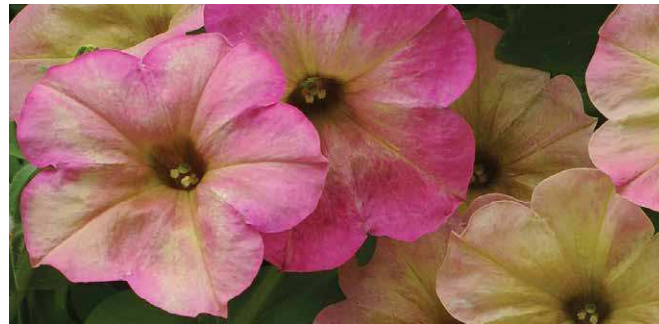
Debonair Dusty Rose