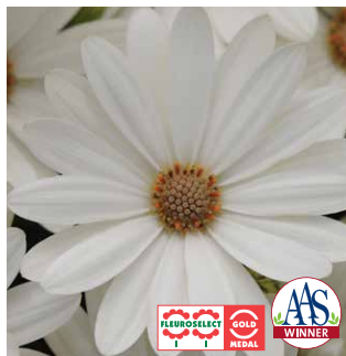
Daisy White All-America Selections National Winner, Fleuroselect Gold Medal