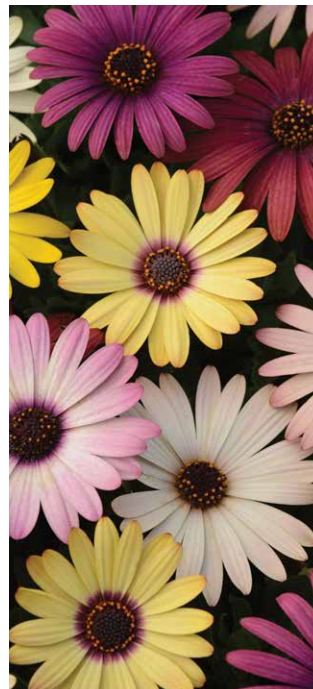
Grand Canyon Mixture