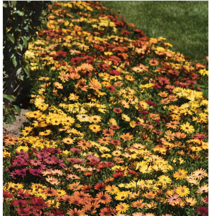
Akila Sunset Shades