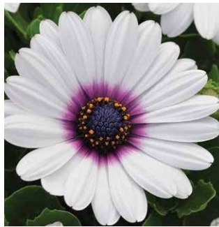
White Purple Eye