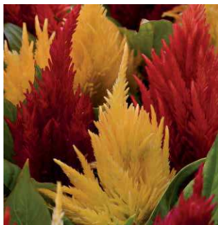
First Flame Mixture