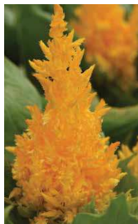
First Flame Yellow