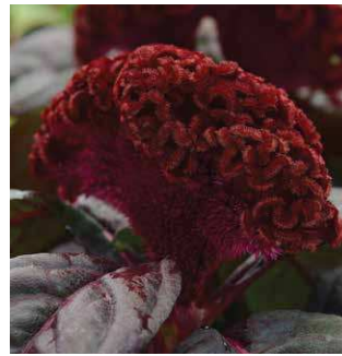
Concertina Red Dark Leaf