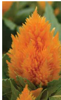
Ice Cream Yellow