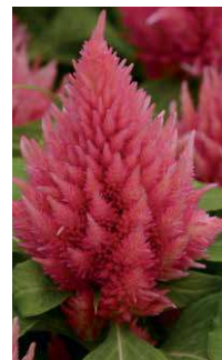
Ice Cream Salmon