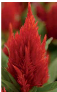
First Flame Scarlet