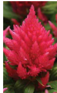
Ice Cream Pink