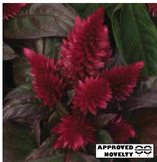
Kosmo Purple Red Fleuroselect Novelty