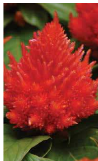
Ice Cream Orange