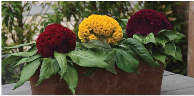
Concertina Red, Yellow & Purple