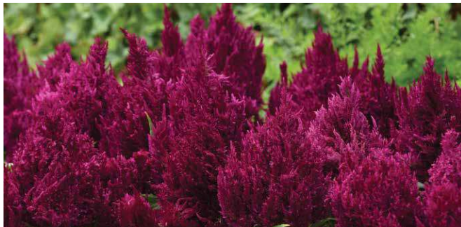
First Flame Purple