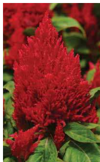
First Flame Red