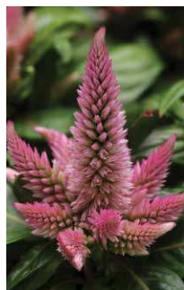
Kosmo Pink US PVP 200400022