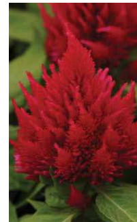
Ice Cream Cherry