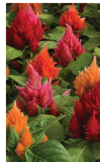
Ice Cream Mixture