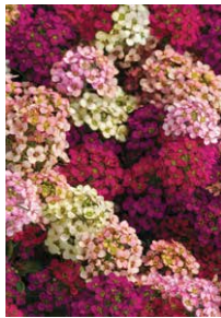
Easter Bonnet Mixture