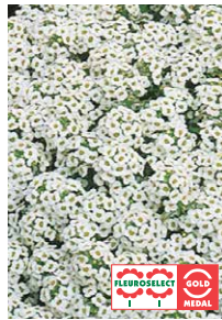
Snow Crystals Fleuroselect Gold Medal