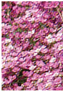
Easter Bonnet Deep Pink