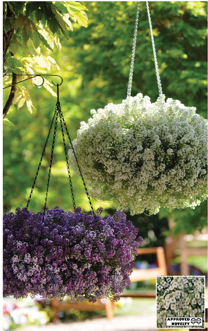
Clear Crystal White Fleuroselect Novelty US 7,915,504 and Clear Crystal Lavender Shades US 7,915,504