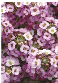
Clear Crystal Lavender Shades US 7,915,504