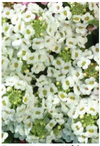
Easter Bonnet White