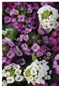
Clear Crystal Mixture US 7,915,504