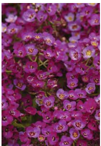
Clear Crystal Purple Shades US 7,915,504