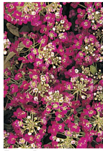
Easter Bonnet Deep Rose