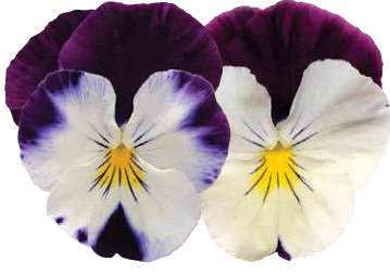
Violet Wing Medal of Excellence Editor's Choice