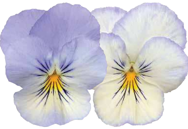
Frost Medal of Excellence Editor's Choice