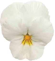
White Medal of Excellence Editor's Choice