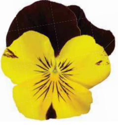
Red Wing / Sunshine 'N Wine