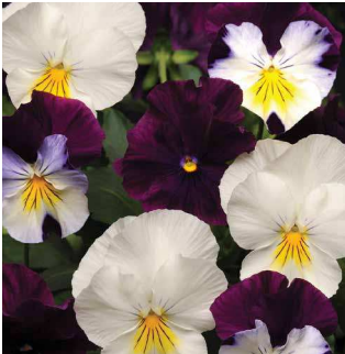
Berries 'N Cream Mixture Medal of Excellence Editor's Choice