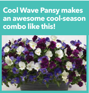
Plug & Play Ocean Breezes see page 237.