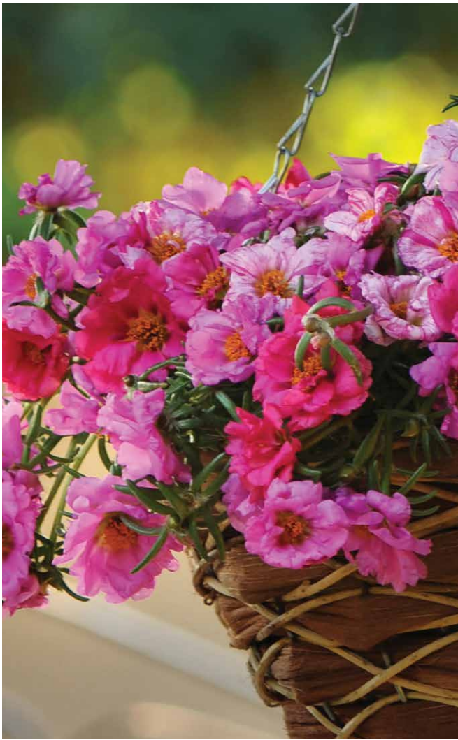
Happy Trails Pink